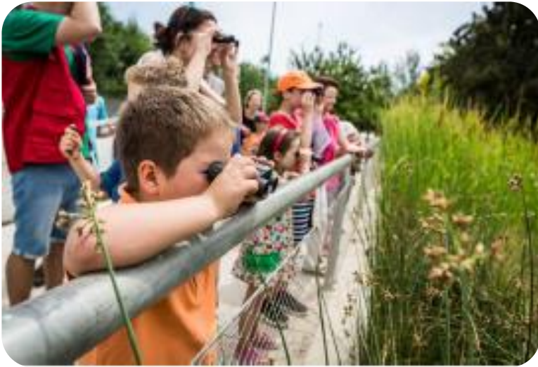
Near-city nature and urban biodiversity