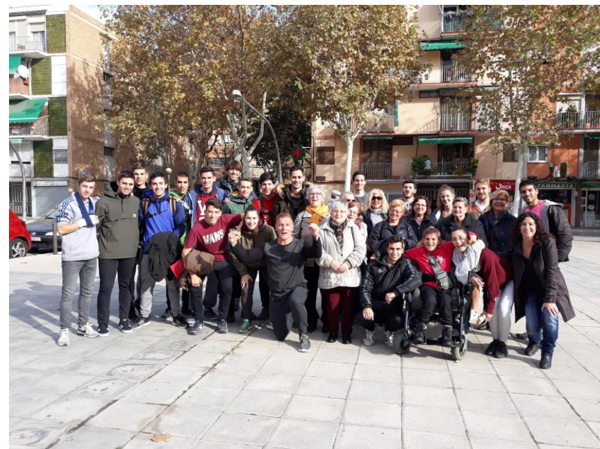
Be active! – Joan Maragall (Badalona)