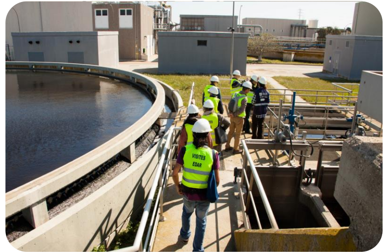
Environmental education visits

Estació depuradora d'aigües residuals (EDAR) i Casa de les Aigües de Montcada i Reixac